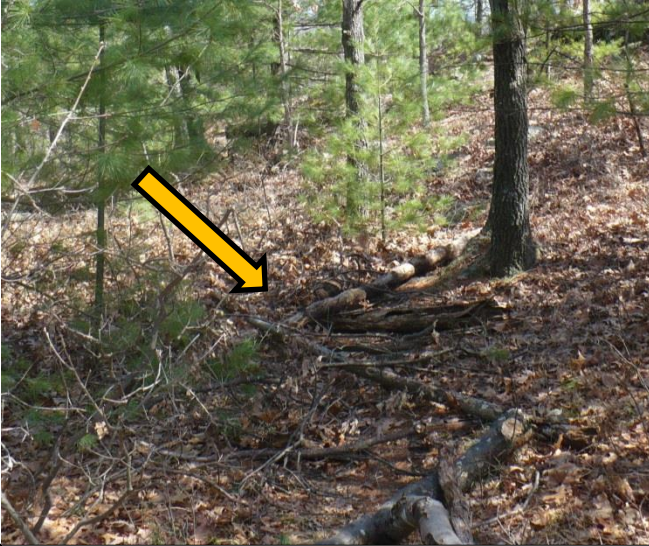
Above: closed bootleg trail, brush piled helter-skelter. Right: AMC Complete Guide (page 157).

OBJECTIVE: Concentrate use on the trail. Discourage hikers from creating multiple “bootleg” paths and prevent trail widening and associated trampled vegetation, compacted soil and hastened erosion.