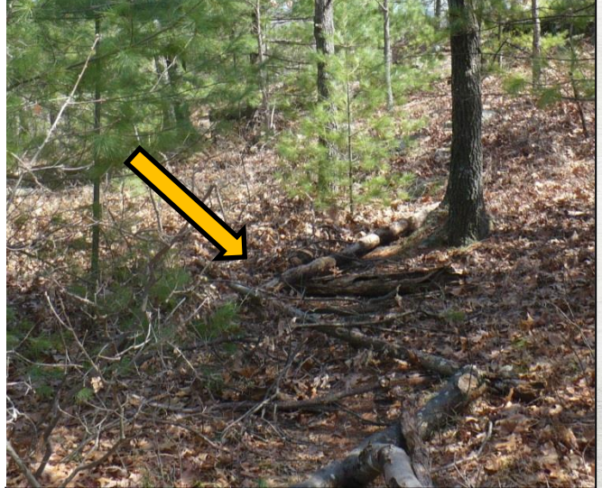
Above: closed bootleg trail, brush piled helter-skelter. Right: AMC Complete Guide (page 157).

OBJECTIVE: Concentrate use on the trail. Discourage hikers from creating multiple "bootleg" paths and prevent trail widening and associated trampled vegetation, compacted soil and hastened erosion.